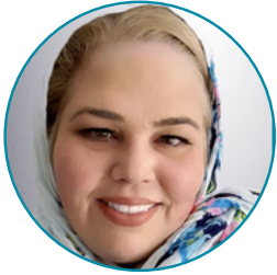
Chassie Selouane American Curriculum Education Expert